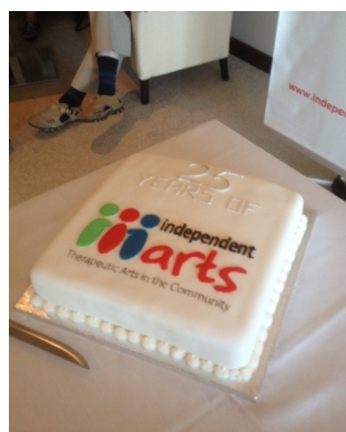
Above is our birthday cake for our 25th celebrations in July!